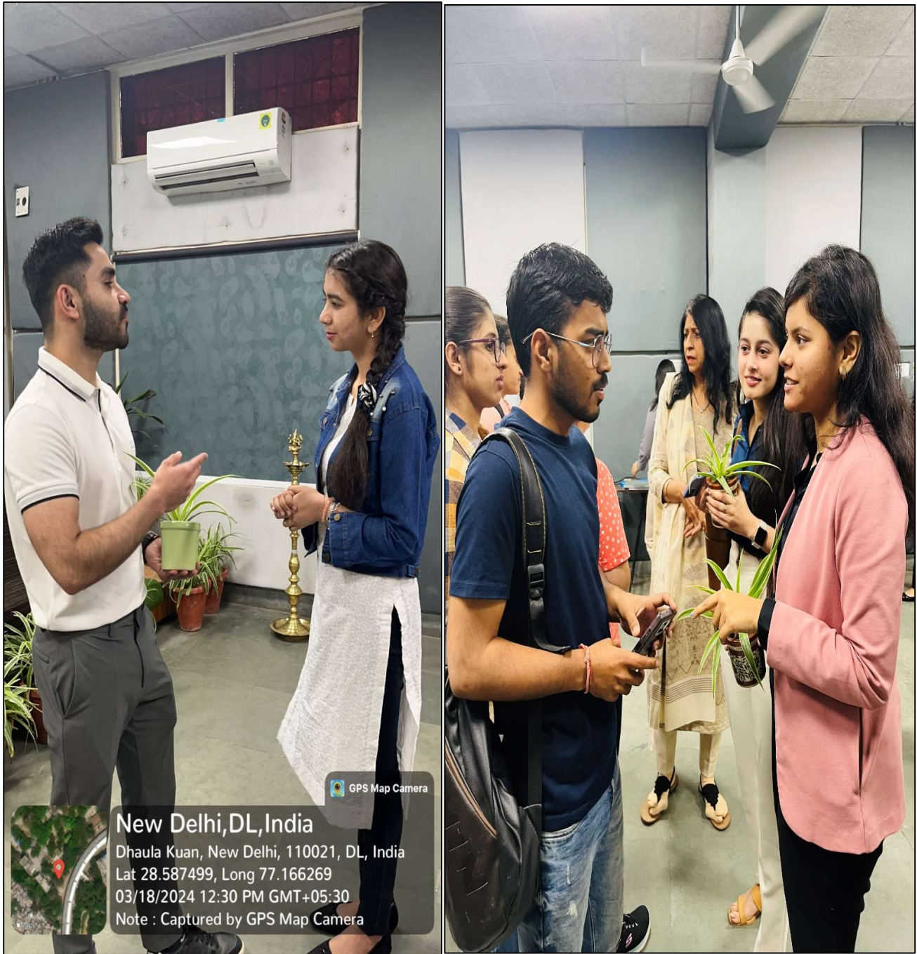
Open discussion between Alumnus and participants